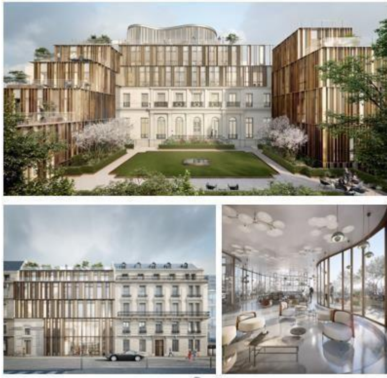
Ulteam – 20 rue Washington – Paris 8 th

With this restructuring operation at 20 rue Washington, Groupama Immobilier is pursuing its policy of high-value added transformation of Paris's emblematic neighbourhoods.