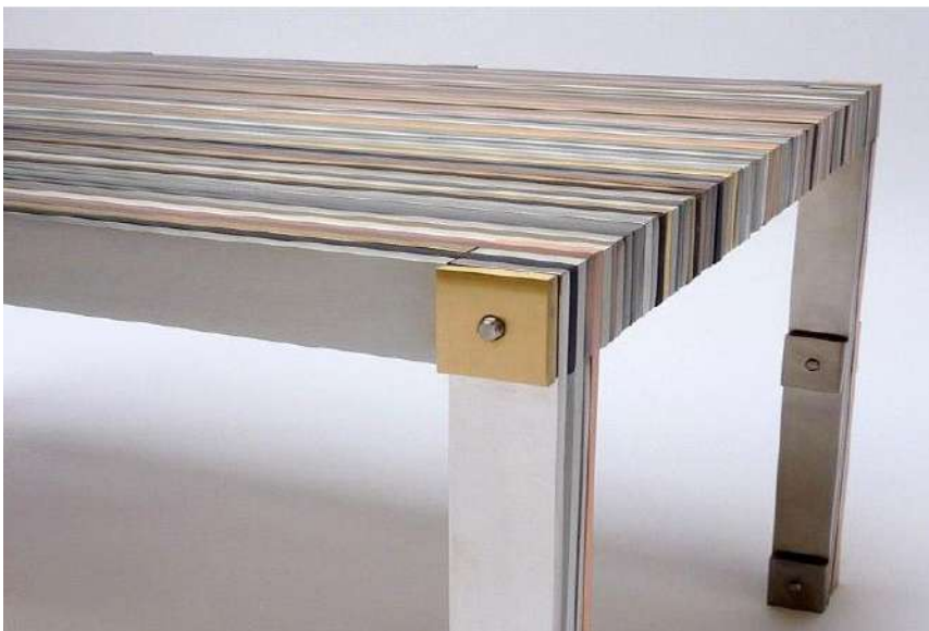
ALICA coffee table, Thomas Lemut