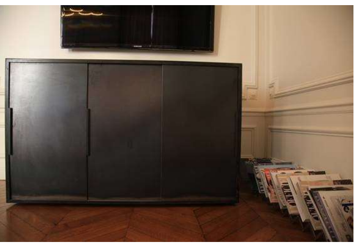
Steel sideboard, private order. © Eric Dexheimer